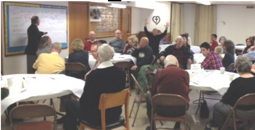
Table 1: Philippians 4:4-9 (Communication – too much or not enough information)

On March 8, 2015 members and attenders of UPC had a Town Hall Meeting to identify UPC needs for change. After a wonderful lunch of fish and loaves, headed by Deacon Lou Malcomb with a team of wonderful cooks, attendees broke into groups to tackle the subject of gremlins that face UPC by visiting 3 of the 6 available discussion tables: