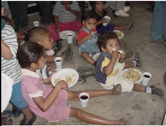
Children enjoy a meal at His Eyes Clinic in Tegucigalpa, Honduras