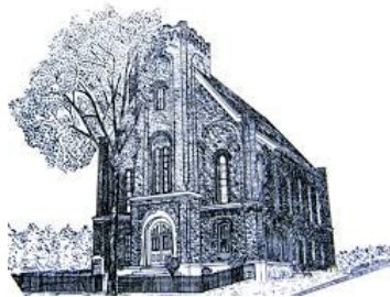
UPC at 9th & College 1871-1951

On Saturday, September 4, 1833, fourteen members and two elders participated in the charter meeting for the Associate Reformed Presbyterian Church in downtown Bloomington. Only 15 years after the founding of the city of Bloomington, the cause for which Abraham Lincoln later won everlasting renown, paid for with his life, was arriving in Bloomington, Indiana, and making historic impact on the town, its young college, and what became United Presbyterian Church.