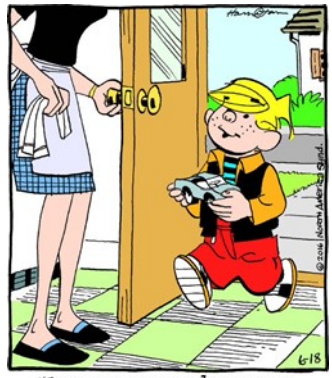
"I GOT THIS AT TOMMY'S PARTY FOR BEING THE FIRST ONE TO GO HOME."