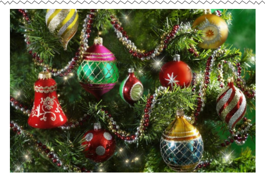
Merry Christmas to all!

"Things turn out for the best for those who make the best of the way things turn out." Published in a Dear Abby column years ago.