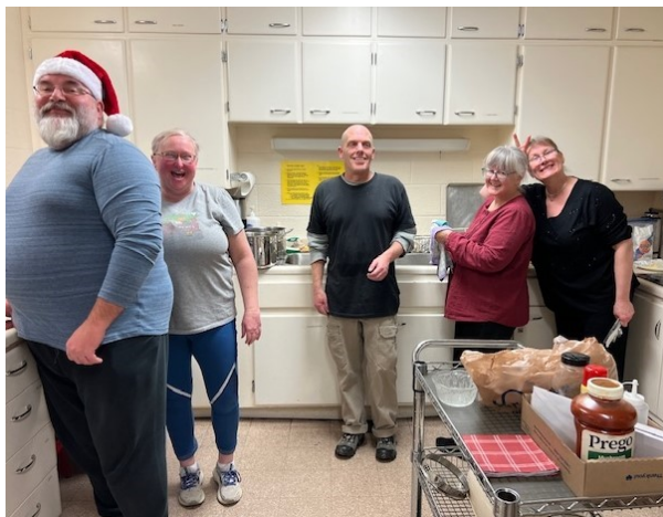
The Kitchen Crew.