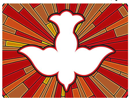
Sunday, May 19 is Pentecost The Pentecost Offering will be received at UPC during the morning worship service.

Psalm 71 testifies that a foundation of faith established during childhood helps ensure lifelong faith and service. The patterns and lessons established during these formative years continue to bear fruit throughout a person's life. By receiving the Pentecost Offering, you are nurturing the faith of those who are the church to come — children, youth, and young adults.