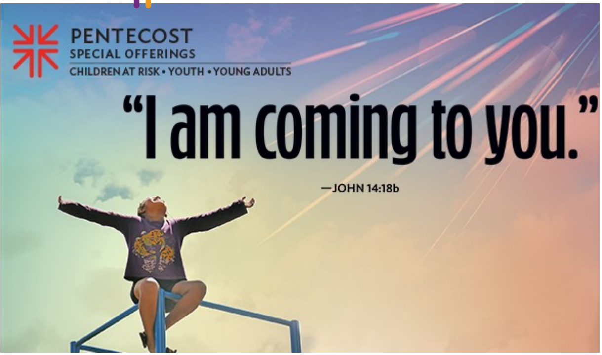
The Pentecost Offering unites us in a church-wide effort to support young people and inspire them to share their faith, ideas, and unique gifts with the church and the world.